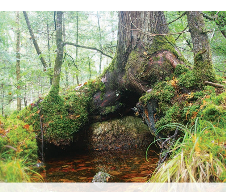
The carbon fluxes of Howland Research Forest in Maine, which is protected as forever-wild by Northeast Wilderness Trust, have been studied for decades. The results show a high carbon storage and sequestration potential of wild northeastern forests.

Net sequestration is the difference between how much carbon the forest absorbs from photosynthesis minus how much it emits through respiration. The former is a function of the leaf area index (LAI), which is the total surface area of all leaves. The