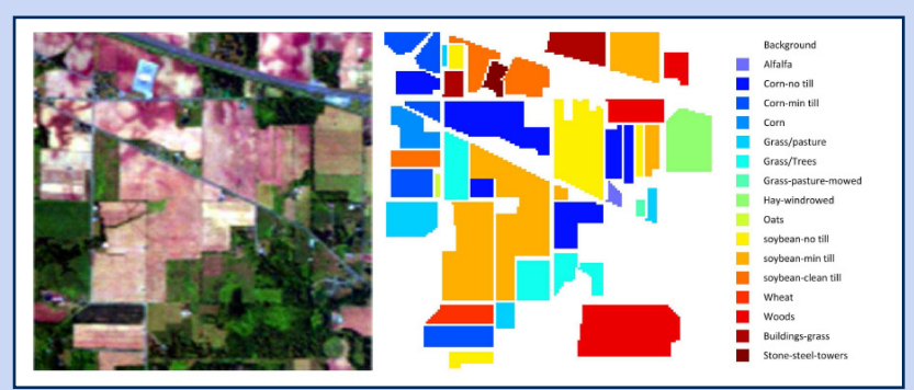
Left: Pseudocolor image of the Indian Pine data set. Right: Ground-truth classification of the Indian Pine data set.

"In our ML-INSPIRES project," Sekeh explains, "we explore deep network approaches for large-scale hyperspectral images (HSI), which are a relatively new remote sensing scheme in forestry and climate change sciences. We develop novel ensemble methods to segment images into tree species. Furthermore, because computational complexity is a prominent challenge in deep network-based algorithms, in this work, we intend to investigate techniques that reduce HSI dimensions and extract informative features as a preprocessing step of our classification/segmentation models."